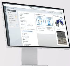
Connect Cloud Software