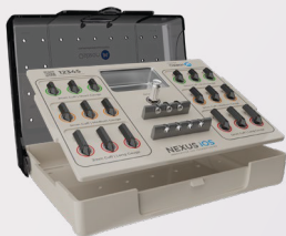
Nexus Scan Gauges

NO PHOTOGRAMMETRY. NO VERIFICATION JIG. Accurate, scalable, full-arch using IOS.