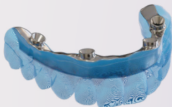
Full-Arch Implant Capture Expert Design Precision Milling